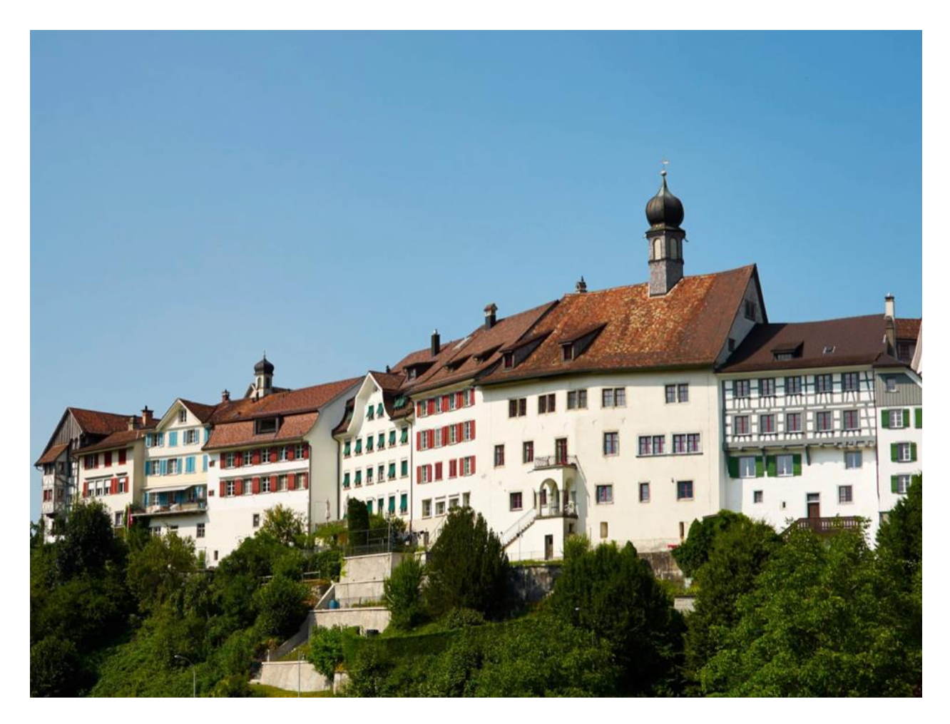
Lichtensteig (SG).

All of these villages and many more feature in the <u>Les plus beaux Villages de</u> <u>Suisse</u> free app available in English for iOS and Android.