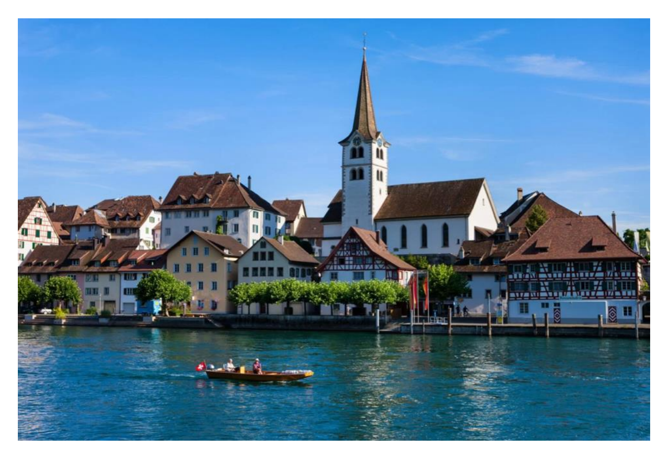
Diessenhofen (TG).