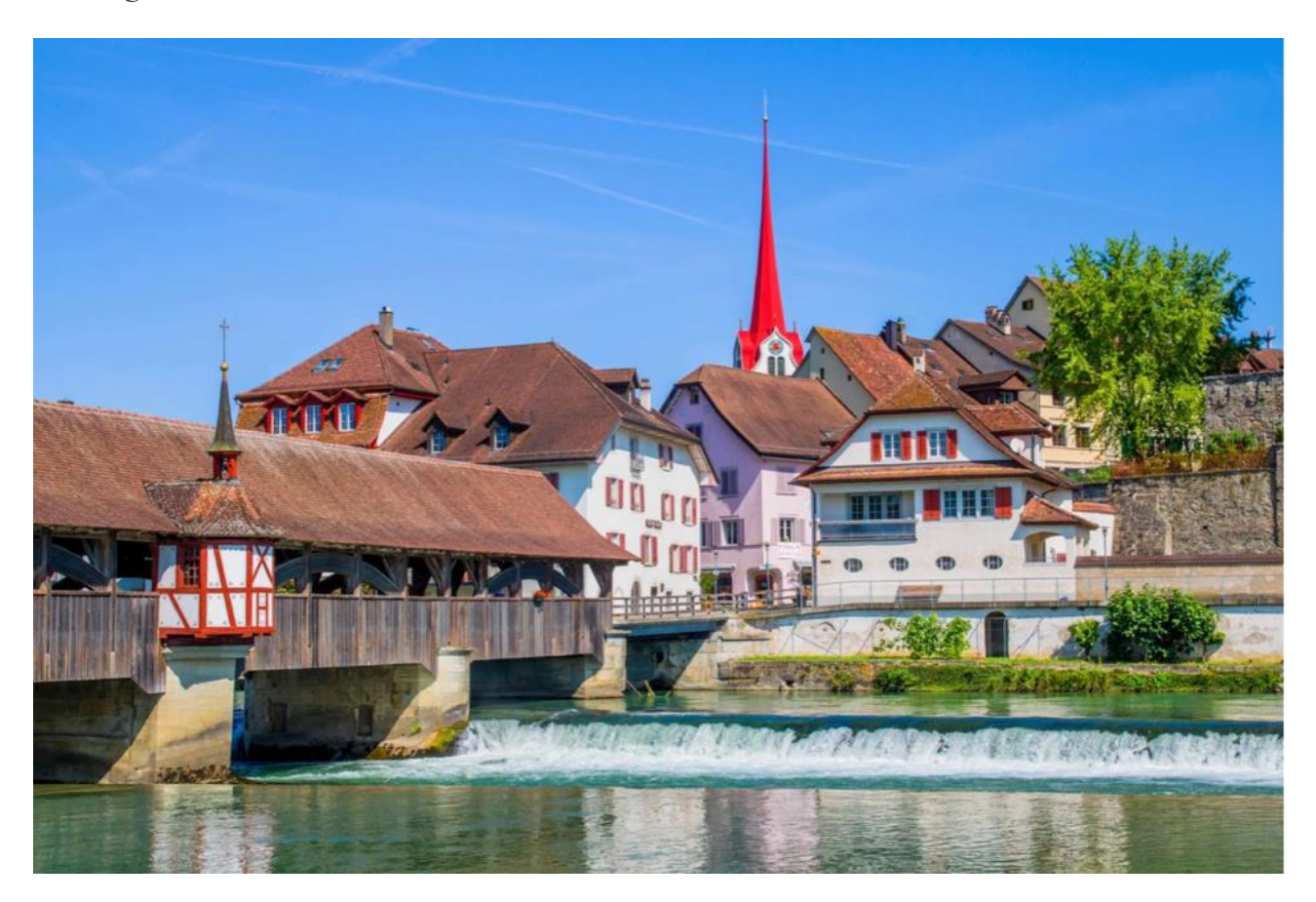
Bremgarten (AG).

Whitsun markets are also very popular and remind us that Bremgarten has always been a place of festivities and conviviality. Must see: The impressive wooden bridge and the busy Marktgasse.