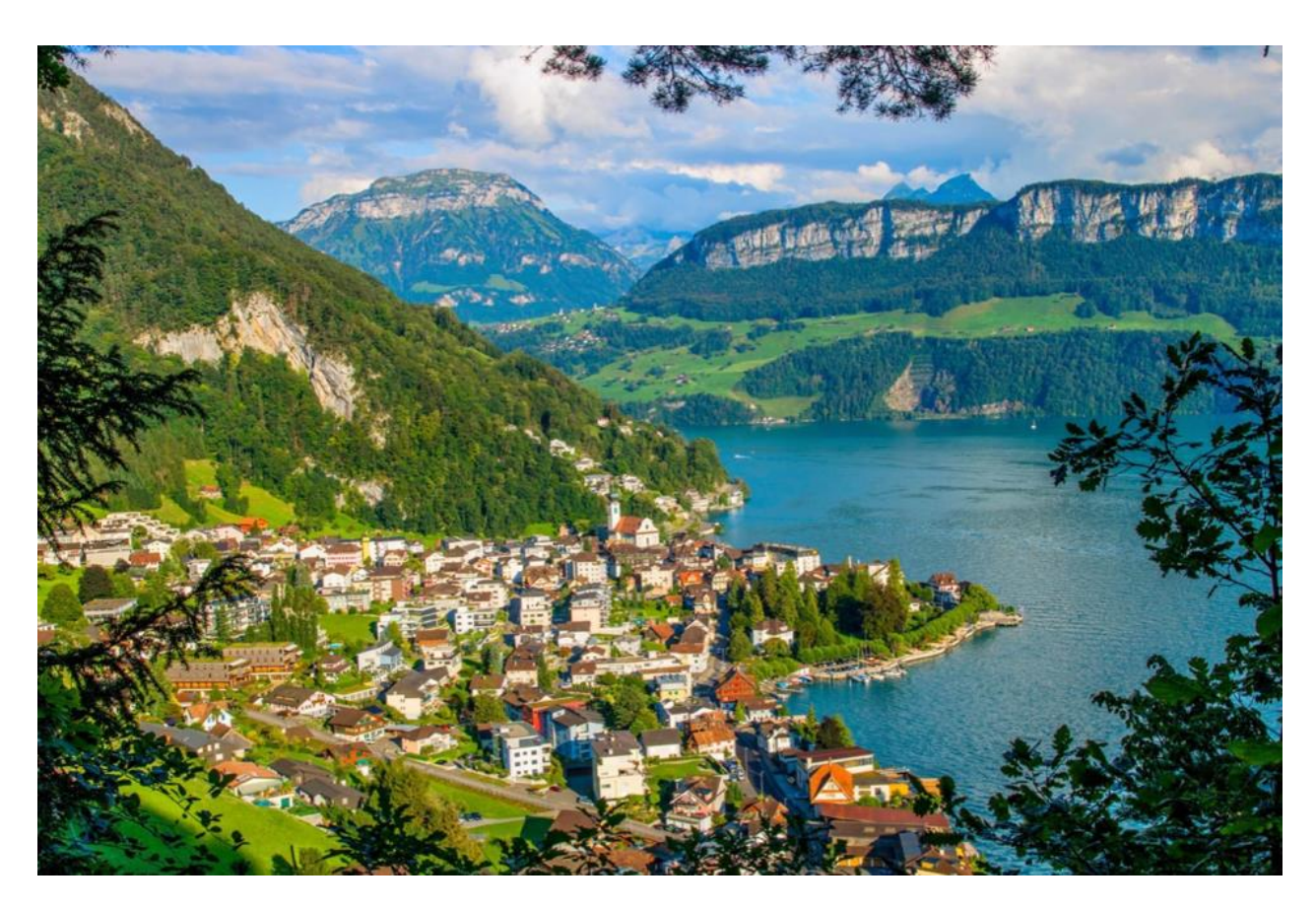
Gersau (SZ).