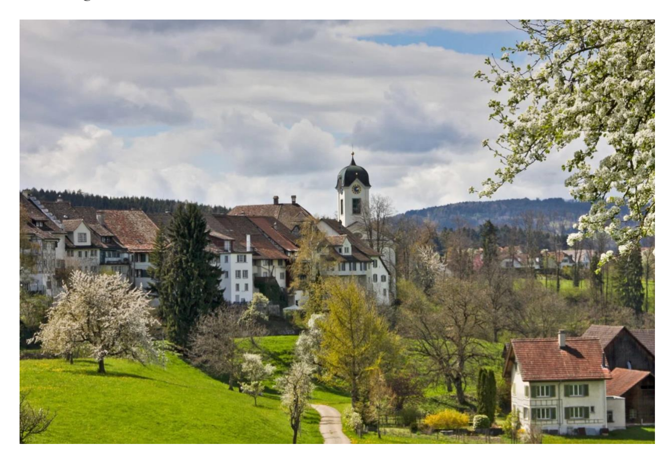
Grüningen (ZH).

In the green meadows of the Zurich countryside lies this picturesque little town with its typical local architecture and a lovely castle. There is also a botanical garden here that is unique in Switzerland. Today, this small town in the Zurich Oberland offers a variety of cultural attractions. No fewer than three museums, including the castle museum. A second exhibits over 10,000 pewter figures in miniature dioramas and the last, free museum is dedicated to the world of beekeeping. There are also several traditional markets in the off-season and a famous Christmas market. Must see: The beautiful castle and the unique botanical garden .